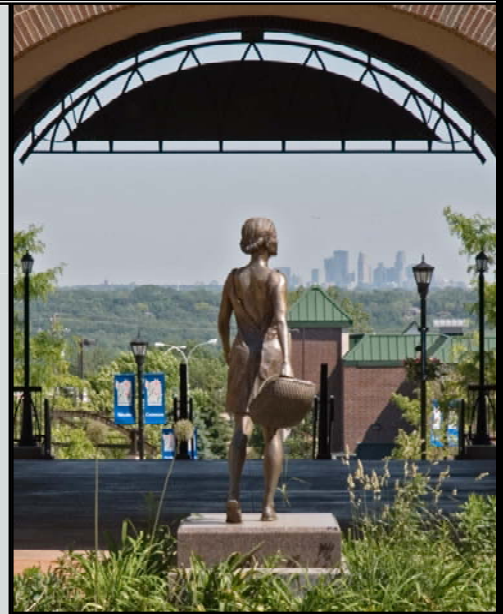
"Abundance" in Heart of the City

Always the Right Experience . . . Burnsville!