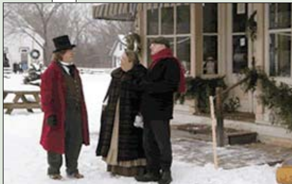
Folkways of the Holidays

www.threeriversparkdistrict.org Enjoy the treasured traditions based on old customs at this 19th century holiday celebration. Horse-drawn trolleys carry guests as candles beckon from windowpanes. Each weekend, guests can tour 11 different holiday settings and enjoy lively folk artist performances to experience the 19th century traditions of the many ethnic groups that settled in the Minnesota River Valley. December weekends. Last admission in 3 pm. Group rate $7 pp.