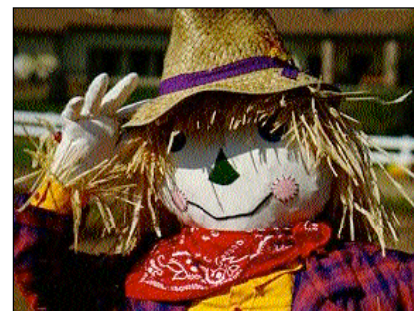
Great Scarecrow Festival

Dakota City Heritage Village Dakota County Fairgrounds 400 220th St. W., Farmington 55024 651 460-8050 www.dakotacity.org Held the first two Saturdays and Sundays in December. Visitors enjoy horse-drawn trolley rides around the village with a costumed guide, cooking and needlecrafts in the Harris House, wood crafts in the Depot, an ethnic Christmas tree in the Law Office and choirs and individuals providing holiday music in the Church. Hot food and other refreshments available. Admission is $6 pp 13 years and up.