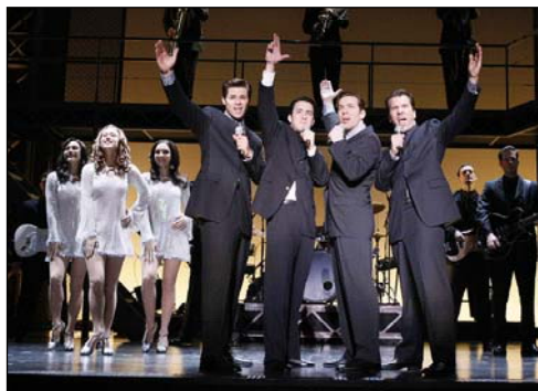
Jersey Boys at the Orpheum Theatre

Admission: Group rates for most performances.