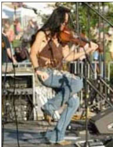
Art And All That Jazz

Home to Burnsville's top events, you can also catch a free concert or movie at this popular water-inflated park in Burnsville's Heart of the City. View great sculpture within the block. Lighted trees during the holiday season.