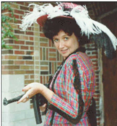
Down in History Tours

Historic Courthouse 101 W. Pine St., Stillwater 55082 651 439-6110 www.valleytours.com Enjoy a guided tour of the quaint rivertown Stillwater and the picturesque St. Croix Valley. Specialty tours include step-on guides in Victorian dress, tours of Victorian homes, foliage tours and Swedish heritage tours. Tours may be customized for your groups and may include river cruises, train excursions, churches and artist's studios. Personable, friendly and professional service for groups of 20-200. Can be customized.