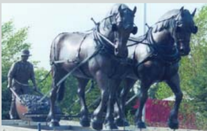
Bronze Sculpture in Heart of the City