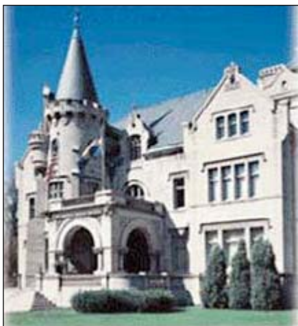
American Swedish Institute

Special Event: Christmas decorations and events November and December.