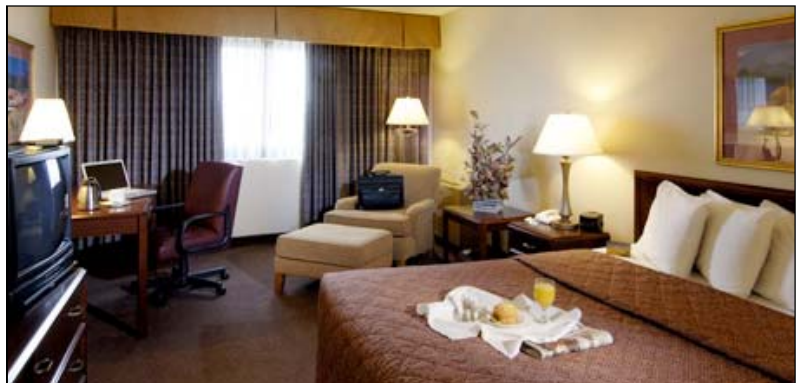
Holiday Inn Burnsville

ENJOY Burnsville's FREE on-site motorcoach parking and LOWER lodging tax!